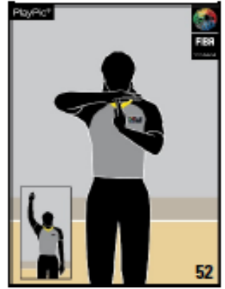
Form T, showing palms